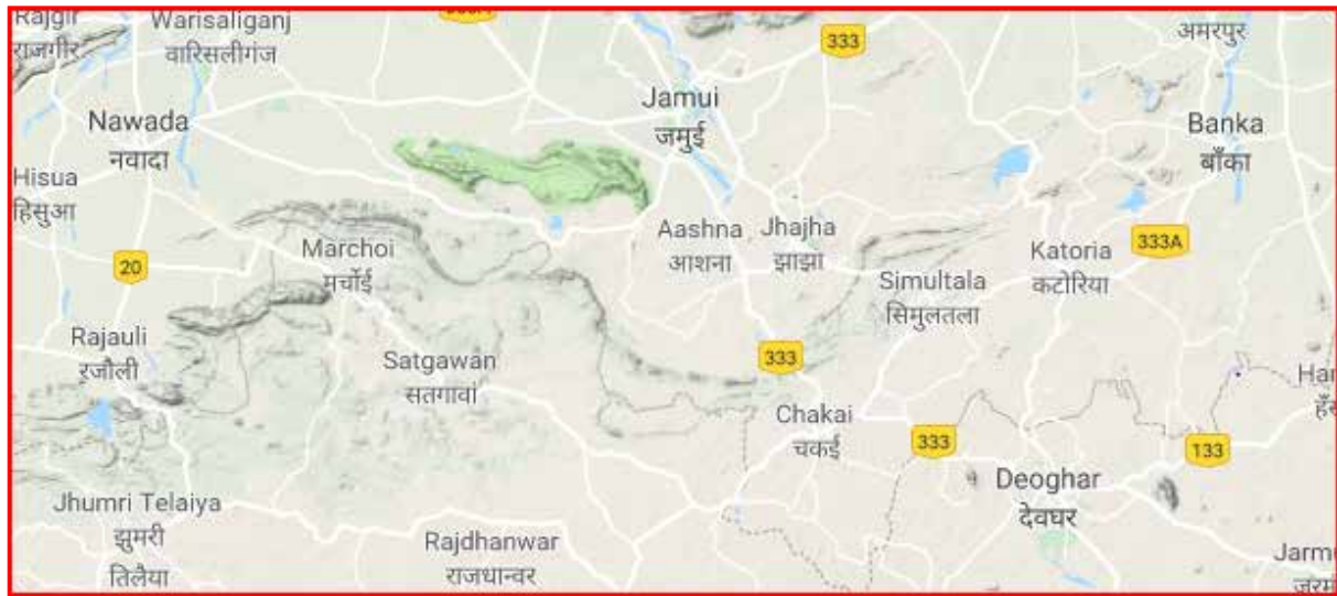
Jamui Area (Map-4A)

rocky surface. The terrain map of Jamui area clearly shows the rocky elevation in this route.